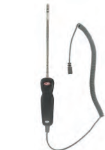
Replaceable Probe with Secure 6 Pin Adapter

The Model 471B Digital Thermo Anemometers are versatile dual function instruments that quickly and easily measure air velocity or volumetric flow plus air temperature in imperial or metric units. High contrast LCD display shows both selected readings simultaneously. Convenient backlight provides perfect visibility in low light conditions. Light automatically shuts off after 2-1/2 minutes to prolong battery life. Low battery warning is included. Stainless steel probe with comfortable hand grip is etched with insertion depth marks from 0 to 8 inches and 0 to 20 cm. Extruded aluminum housing fully protects electronics, yet is lightweight and comfortable to hold even when taking multiple readings as part of duct traverses. Up to 99 readings may be stored for later retrieval. An integral sliding cover protects sensors when not in use. Items included with the 471B are 9 volt alkaline battery, sensing probe, wrist strap and custom carrying case.