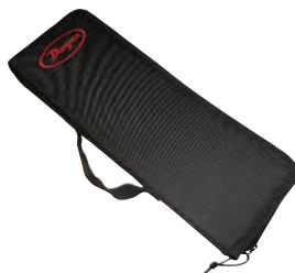
Soft Carrying Case Included with Every Unit