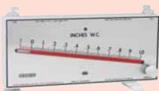
Mark II Model No. 40-1 inclined manometer

*Require Pitot tube at additional cost. See Air Velocity section.