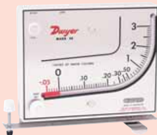
Mark II Model No. 25 inclined-vertical manometer. (shown with optional A-612 portable stand)